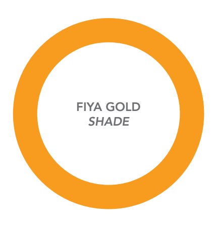
Pantone 1375 C10 M45 Y97 K0 R249 G157 B34 HEX F99D22